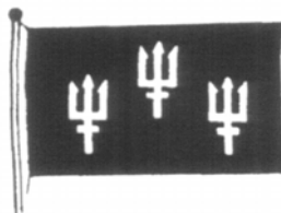
November 2010 Bay Neigh Cdr Claire McDonald, SN