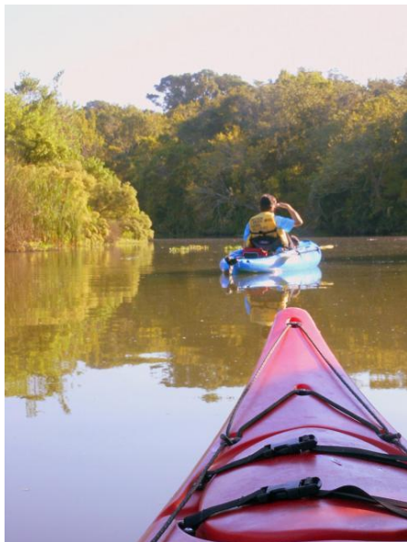
(More Pictures on Pages 4 and 6)

I also went out on October 13 th to Bay Area Park, just off Bay Area Blvd, and spent 8 hours on the water on Armand Bayou, which is a really great "paddling trail." We saw plenty of water birds, beautiful plant life and one pretty good sized gator, about 8' long! I went with a friend of mine, recently transplanted here from Rhode Island and that's how I got so interested in kayaking. Well, I'm certainly HOOKED now and there's no turning back. We rented a couple from Austin Canoe and Kayak and I made sure to get the Hobie Outback and what a great day on the water it was.